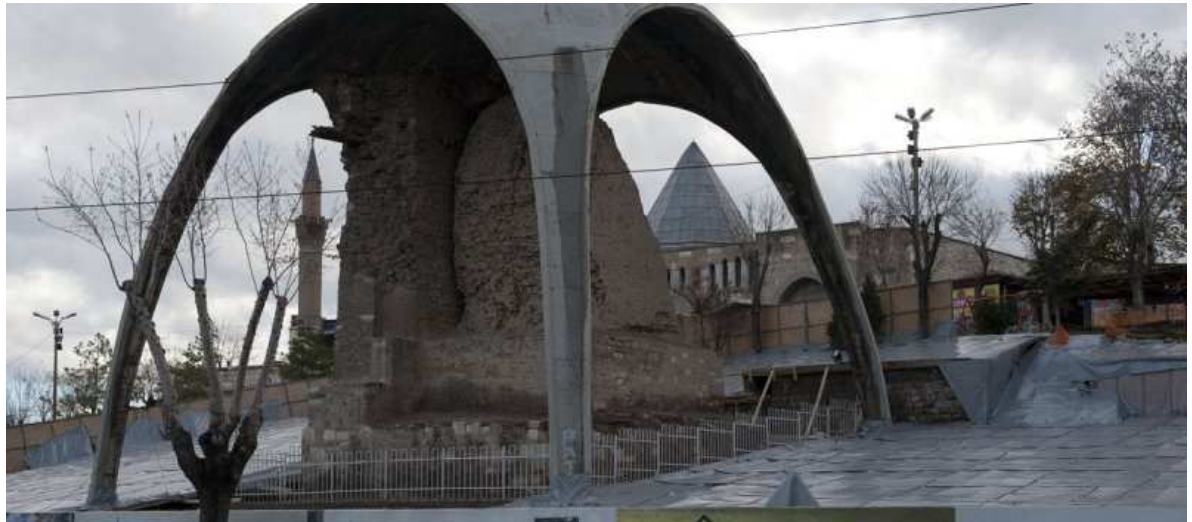
Palest of Selçuklu Han

Konya was inhabited from prehistoric era and houses many vernacular and monumental earthen heritage of Hittites, Phrygians, Greeks, Lydians, Romans, Seljukians and Ottomans.